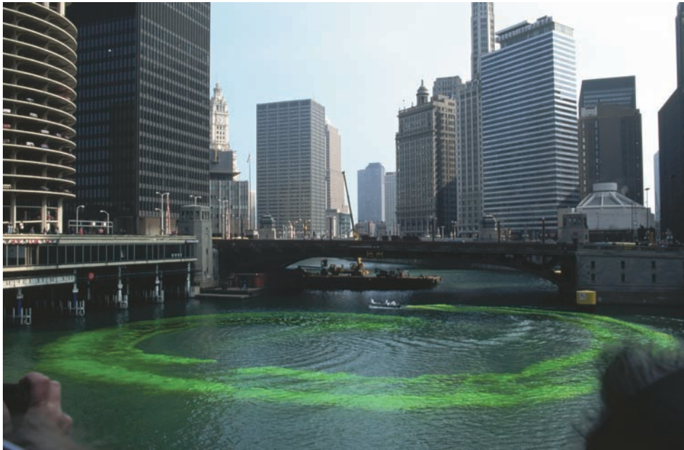
The Chicago River becomes green for St Patrick's Day.